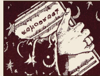
Tome of Efficiency

This magical book adapts to the Wizard's study habits enabling the simultaneous memorization of all four elemental spell groups. May only be used by the Wizard.