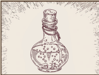
Phial of Healing

This flask allows the capture of an additional one body point healing potion each time the Water of Healing spell is cast. Once filled, the phial may be distributed to and carried by any hero but must be consumed in the current quest. May only be used by the Wizard.