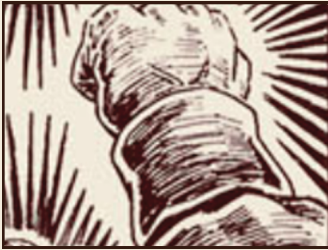
Bracer of Flame

This charmed arm band allows a magic user to shoot small fireballs with the ranged attack strength of 2 combat dice three times per quest. May only be used by the Wizard or Elf .